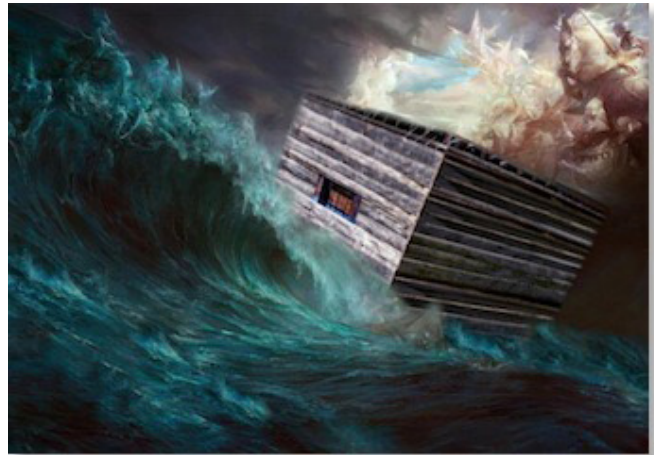
The Gilgamesh ark