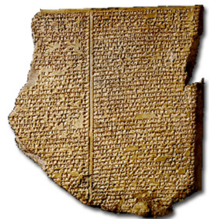
The Gilgamesh cuneiform tablet

As a lover of history, I am interested in questions like this one because it provides me the opportunity to delve into the histories, myths and legends of ancient cultures. The question to be answered in this essay is: What is the relationship between the flood accounts of the Gilgamesh Epic and the book of Genesis?